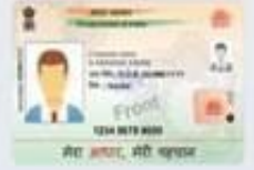
Aadhaar PVC Card