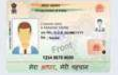
Aadhaar PVC Card